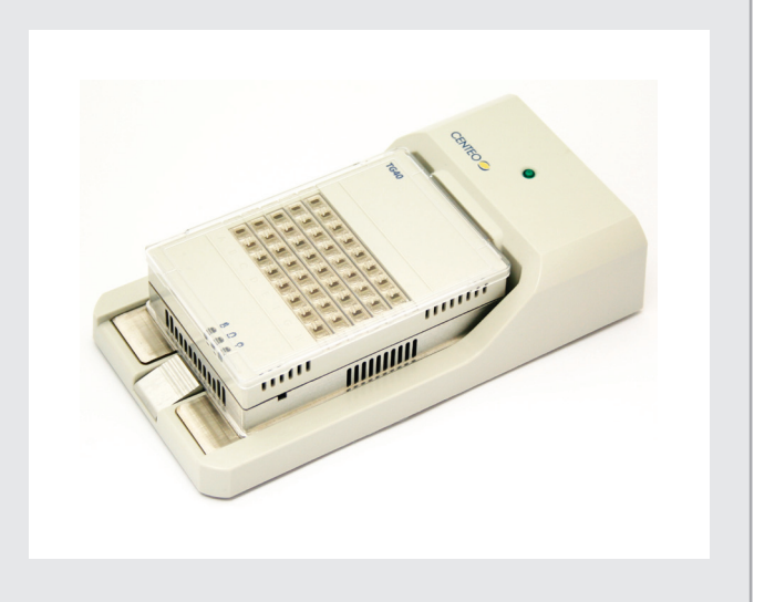
Plate storage and inspection: Minstrel HT-UV + Gallery HT (Rigaku)